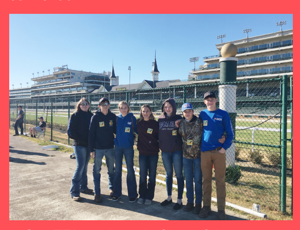
Our FFA students in front of the historic twin spires of Churchill Downs.