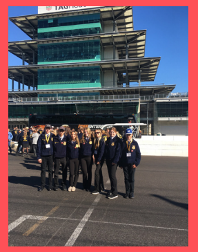
Our FFA students toured the Louisville Slugger Museum & Bat Factory and the Indianapolis Motor Speedway, also known as The Brickyard.