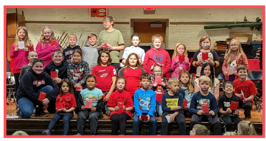
At our monthly Citizens' Assemblies our elementary students are recognized for being Bucket Fillers, Soaring Tanagers, demonstrating the monthly character trait, having their writing published in The Chronicle, birthdays, and more!